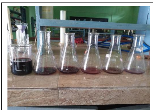
Figure no.7 : Adsorption results in different amount of biochar