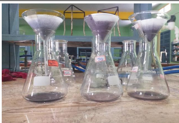
Figure.3 : Filtration process

About 0.015g of Eriochrome Black T is accurately weighed out using an analytical balancer into a 250 ml beaker containing distilled water. The transmittance value of the colored solution were recorded. The 20 ml of the above solution is transferred into different conical flasks. 0.35g of adsorbent added to each of the conical flask. Mixed well with a mechanical shaker for a constant time interval. After shaking the conical flasks are taken out and filtered using whatman no - 41 filter paper. The transmittance values of the filtrate solutions are recorded.