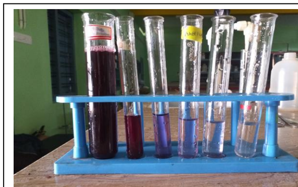
Figure 8 : Adsorption results in different time

From observations it is found that, the color of the dye got decreased with increasing amount of adsorbent and with that of increasing time of shaking. This is because, as the amount of adsorbent increases, rate of adsorption also increases. As a result of more amount of dye get adsorbed, its concentration decreases and it seemed to be more lighted in color than the mother solution taken. Likewise, increase in time of shaking also increases rate of adsorption