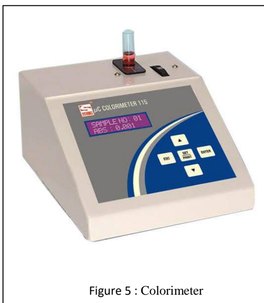
Figure 5 : Colorimeter

Output: the output from a colorimeter may be displayed by an analogue or digital meter and may be shown as transmittance (a linear scale from 0 to 100%) or as absorbance (a logarithmic scale from 0 to infinity). The useful range of the absorbance scale from 0 to 2 but it is desirable to keep within the range 0 to 1, because above 1, the results become unreliable due to scattering of light. In addition, the output may be sent to a chart recorder, data logger or computer.