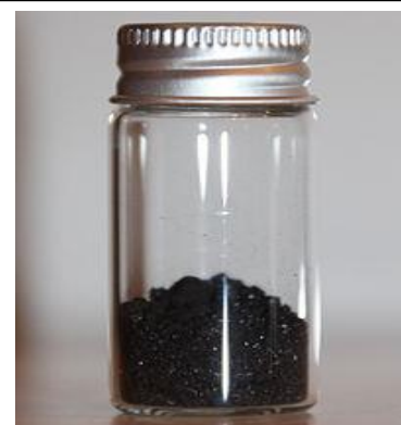
Figure 1 : Eriochrome Black T

When used as an indicator in an EDTA titration, the characteristic blue end-point is reached when sufficient EDTA is added and the metal ions bound to the indicator are chelated by