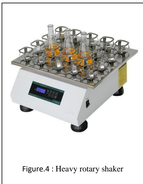
Figure.4 : Heavy rotary shaker

A platform shaker has a table board that oscillates horizontally. The liquid to be stirred are held in beaker, jars, or Erlenmeyer flasks that are placed over the table, or sometimes, in test tubes or vials that are nested into holes in the plate.